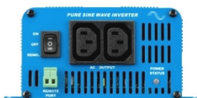
Phoenix Inverter 12/350 with IEC-320 sockets