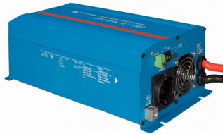
Phoenix Inverter 12/800 with Schuko socket