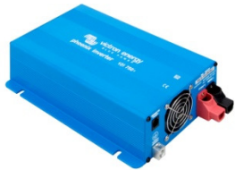
Phoenix Inverter 12/750